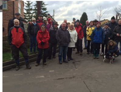
Valentines Day Walk