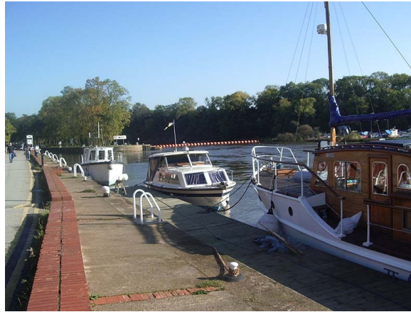
GUNTHORPE LOCK IN THE SUNSHINE ANNUAL DINNER DANCE