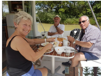
On the Canal du Midi