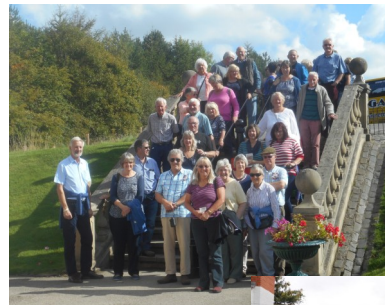
Visiting Beamish Museum on one of our Mystery Trips