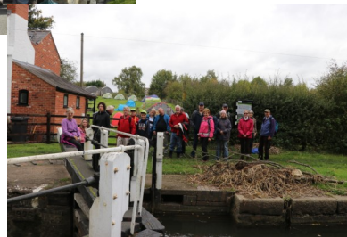
One of our Towpath Walks